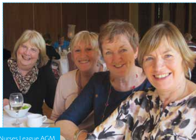
Nurses League AGM